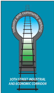
BID #37's logo and the design used for the banners