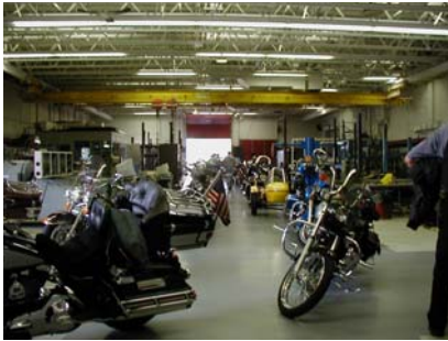
Motorcycles from the 2004 Made in Milwaukee Tour fill B83's facility while participants take a tour.

B83 Testing & Engineering is a testing facility specializing in structural durability, vibration and environmental testing for aerospace, automotive, medical, electronic, agriculture, construction, mining, defense, transportation, industrial and consumer products industries. They serve a variety of clients from the Milwaukee area, across the U.S. and internationally as well.