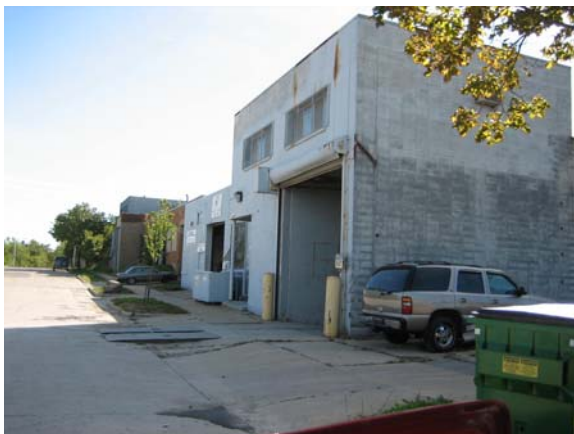
Metal Processing Company's facility on N. 32nd Street